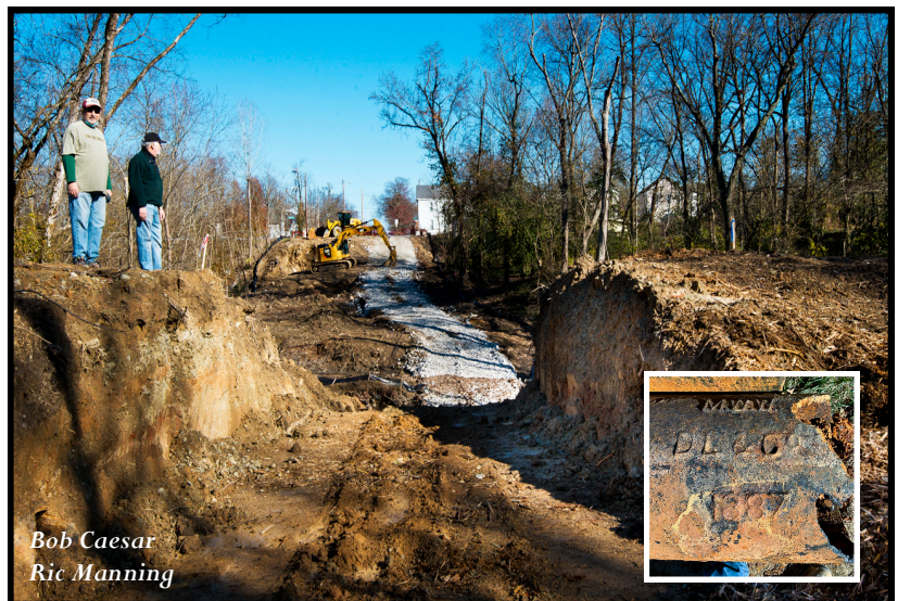
Bob Caesar Ric Manning

The Silver Hills Historical Nature Trail was temporarily closed last fall when the American Water Company began work to replace the main water line from the water tank to Spring Street. A wide path was cut through the woods from the top of the hill clearing the way to replace a 133-year old pipe. The trail was cut in two at the end of the Market Street Hill Road Trail. It will be restored back to its original condition, and the trail will again be reconnected. No other part of the trail was disturbed. A section of pipe dated 1887 was recovered. It will be donated for display on the trail.