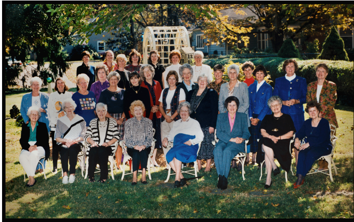
Photograph of The Alpha Club 1996